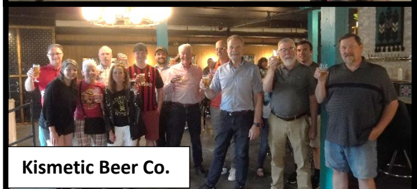
Kismet Beer Co.